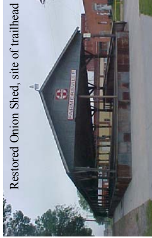
Restored Onion Shed, site of trailhead

Shop nearby on the historic downtown square, enjoy a bite to eat, discover the town that Audie Murphy claimed as his hometown.